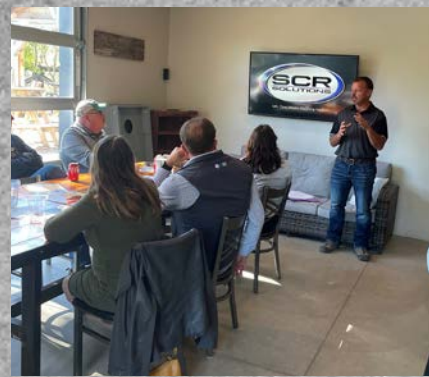
Joint meeting with RRMEA followed by a tour of Spectrum Aeromed November 19, 2024